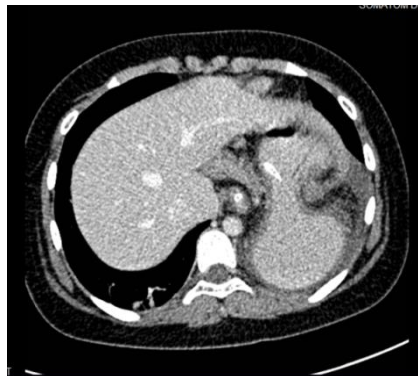
Fig.3. Axial view of the CECT abdomen showing stomach dilatation with wall thickening with herniation through a defect