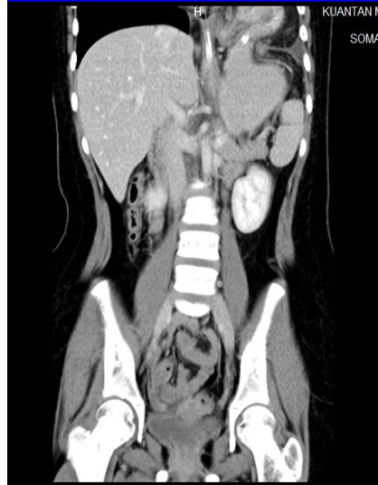
Fig.2. Coronal view of CECT abdomen showing the herniation of the body and pylorus into the left hemithorax