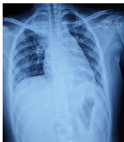
Fig.1. Chest X-ray showing loop of bowel gas in the left hemithorax

A 10-year-old female was admitted to our centre with a recurrent history of pain and feeling fullness over her epigastrium, multiple episodes of vomiting with significant history of retching for the past 1 year and worsening last 1 week. The pain was constant and dull aching. Child denies any history of trauma. On examination, she was a well-nourished child, afebrile, not in respiratory distress or tachycardic. There were no abnormalities noted during her lungs examination; air entry was equal. The abdomen was scaphoid but non-tender. However, she had a mass over epigastric region about 15x15 cm, unable to get above the mass. Routine blood investigations are within normal limits. Radiography of the chest showed bowel gas in the left lower hemithorax with the diaphragmatic outline of left side is not well delineated. Ultrasonography (USG) of the abdomen showed large cystic mass in epigastrium measuring about 17x16x8.7 cm. A contrast enhanced computed tomography (CECT) of the abdomen done then showed part of the stomach is massively distended, herniation of body and pylorus into the left hemithorax through the defect (2.4 cm) of left hemidiaphragm.